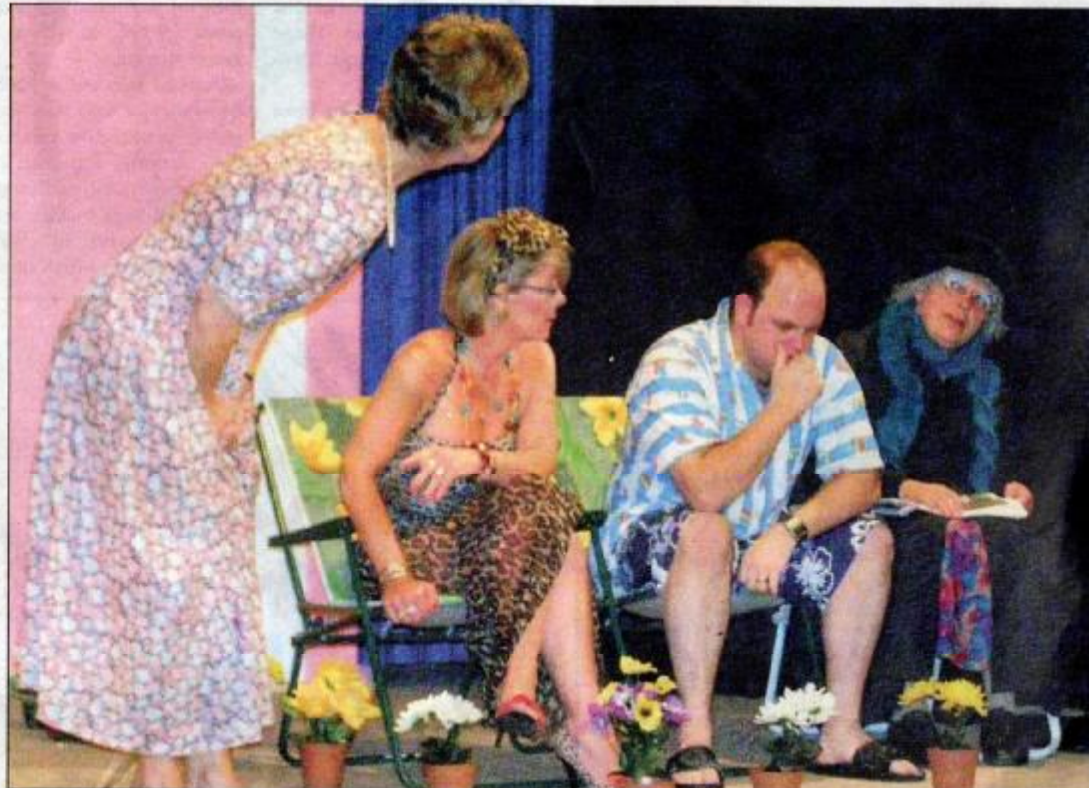
▲ A tense moment during Sand Castles